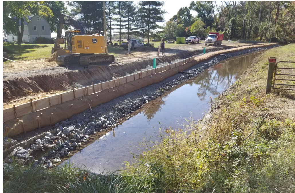
Bucks Branch Tax Ditch Bank Stabilization Project utilizing soil lifts and live stakes.