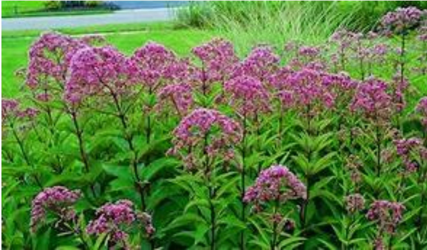
Joe Pye Weed